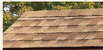
Long-lasting Architectural Shingles