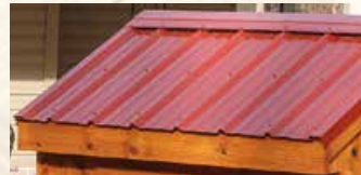
Insulated Metal Roof Adds Character to Any Coop