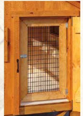
Interior Wire Door for Added Ventilation