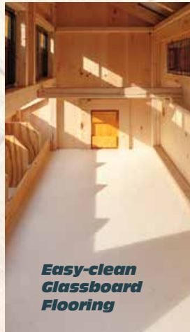
Easy-clean Glassboard Flooring