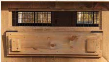
Fold Down Vent with Predator-proof Wire